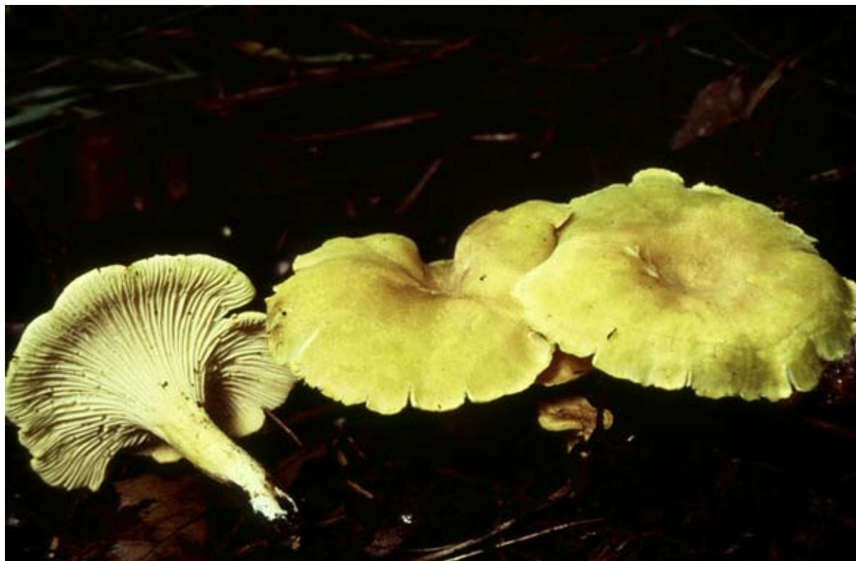
Cantharellus cibarius – Delicious!