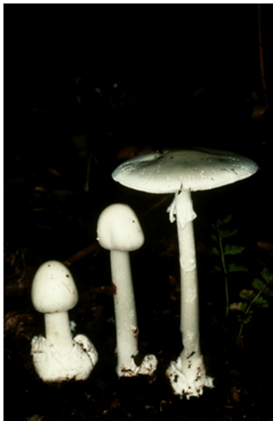
Amanita bisporigera – Deadly!